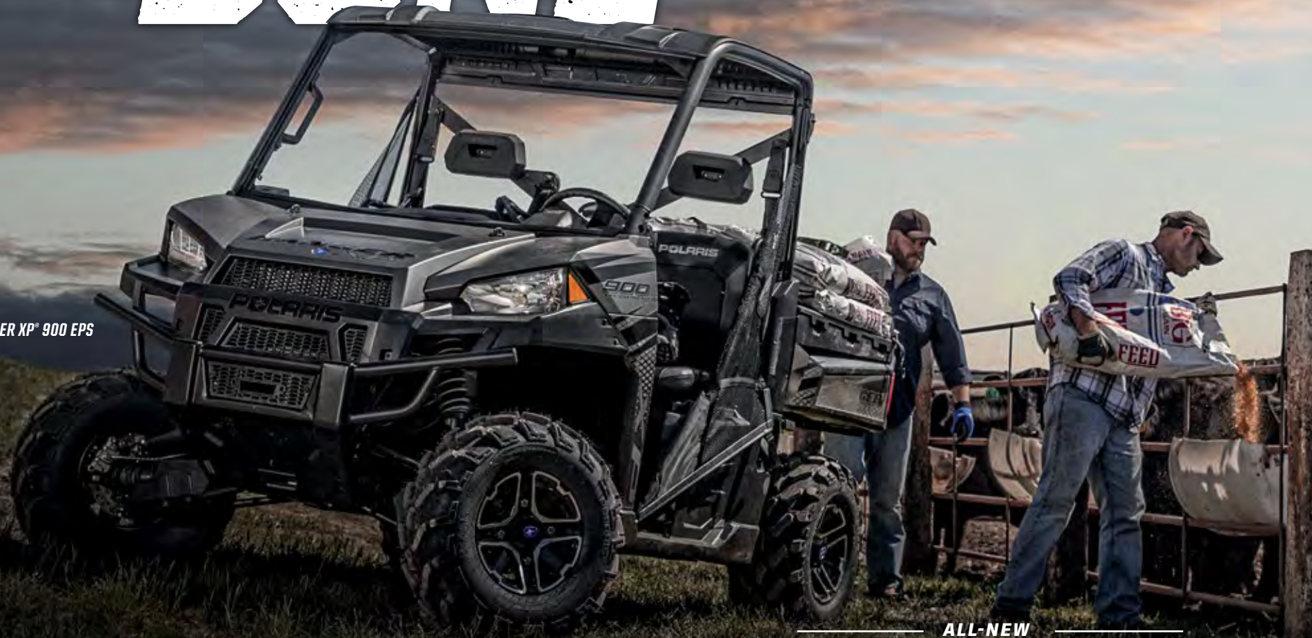
RANGER XP® 900 EPS

The benchmark by which all others are measured, Polaris® RANGER® is the number one selling utility vehicle in the industry –and nothing else even comes close. Delivering on our hardest working, smoothest riding promise, RANGER® offers the most powerful lineup, the best handling and the largest breadth of integrated accessories. You can do more, tow more, haul more and ride more.