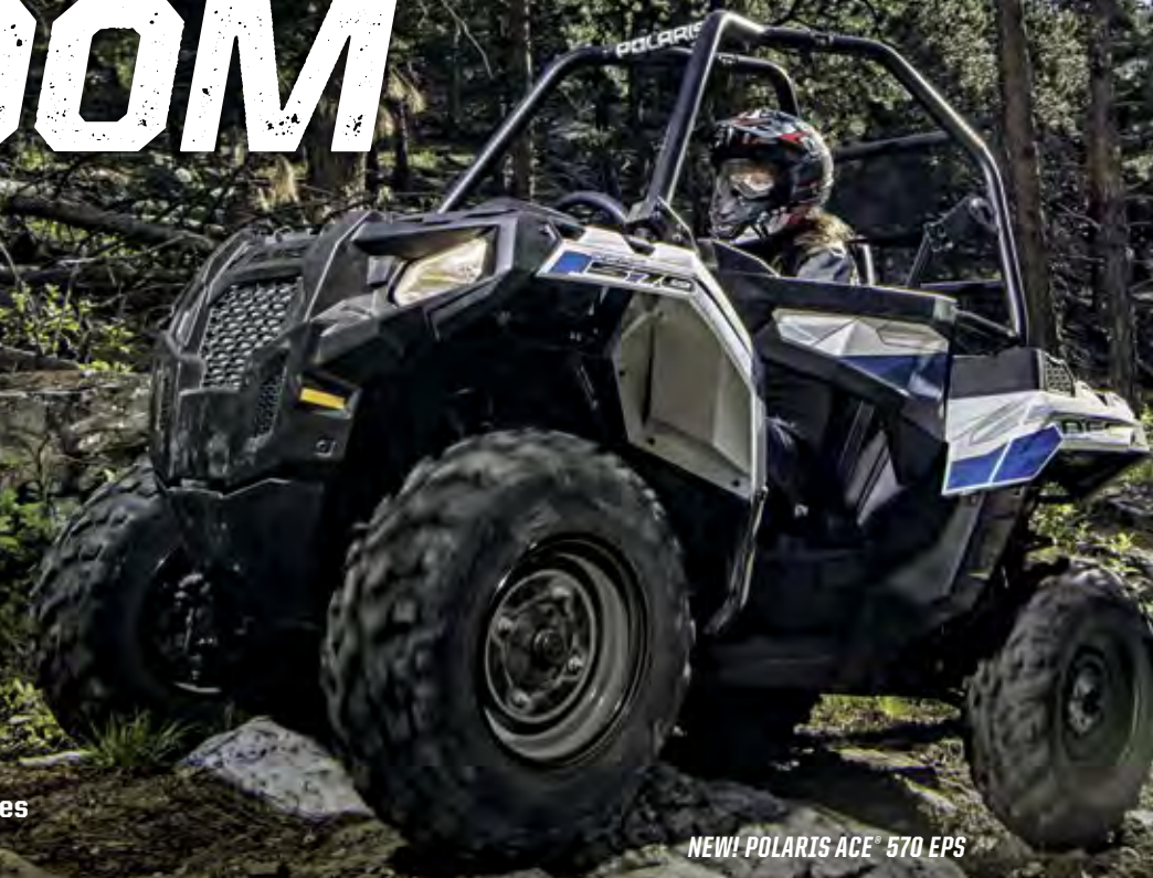
NEW! POLARIS ACE® 570 EPS

Chart your own path with the unparalleled Polaris ACE. Nimble, powerful and comfortable, the Polaris ACE delivers a unique center-seat singular experience with the go anywhere capabilities of an ATV combined with the familiar controls of a side-by-side.