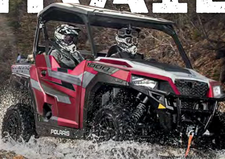
POLARIS GENERAL® 1000 EPS RIDE COMMAND® EDITION

Polaris GENERAL® is the perfect combination of premium-performance and never quit work-ethic, melded into the perfect balance side-by-side that is ready for Any Task. Any Trail. Anytime. Where the high-performance soul of RZR® and the hard-working heart of RANGER® meet, you'll find the uncompromising Polaris GENERAL®.