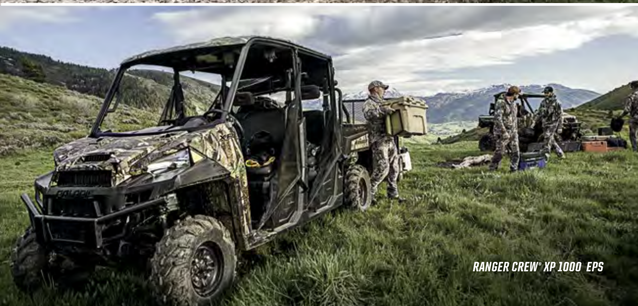
RANGER CREW® XP 1000 EPS